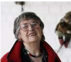
Professor Berit Ås (social psychologist, 1. Deputy chairman of SV party, and founder of the former Nordic women's university)